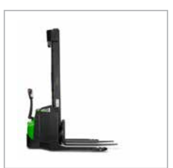
CESAB S210-214, S208L-214L, S220D